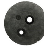
18" X 22" / 30" RADON-PROOF PIT COVER