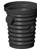
20" X 24" CORRUGATED PUMP PIT