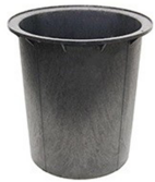
18" X 30" RADON-PROOF PIT