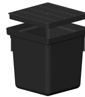
FLOOR DRAIN - 12" X 12" X 12"