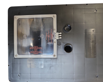
RADON-TIGHT COVER - 18" X 24"