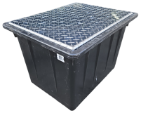
ALUMINUM CHECKER PLATE COVER - 18" X 24"