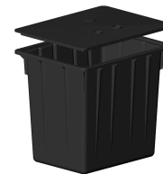
FLOOR DRAIN - 18" X 24" X 25"