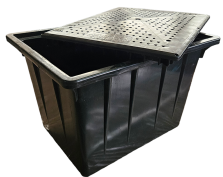
FLOOR DRAIN - 18" X 24" X 18"